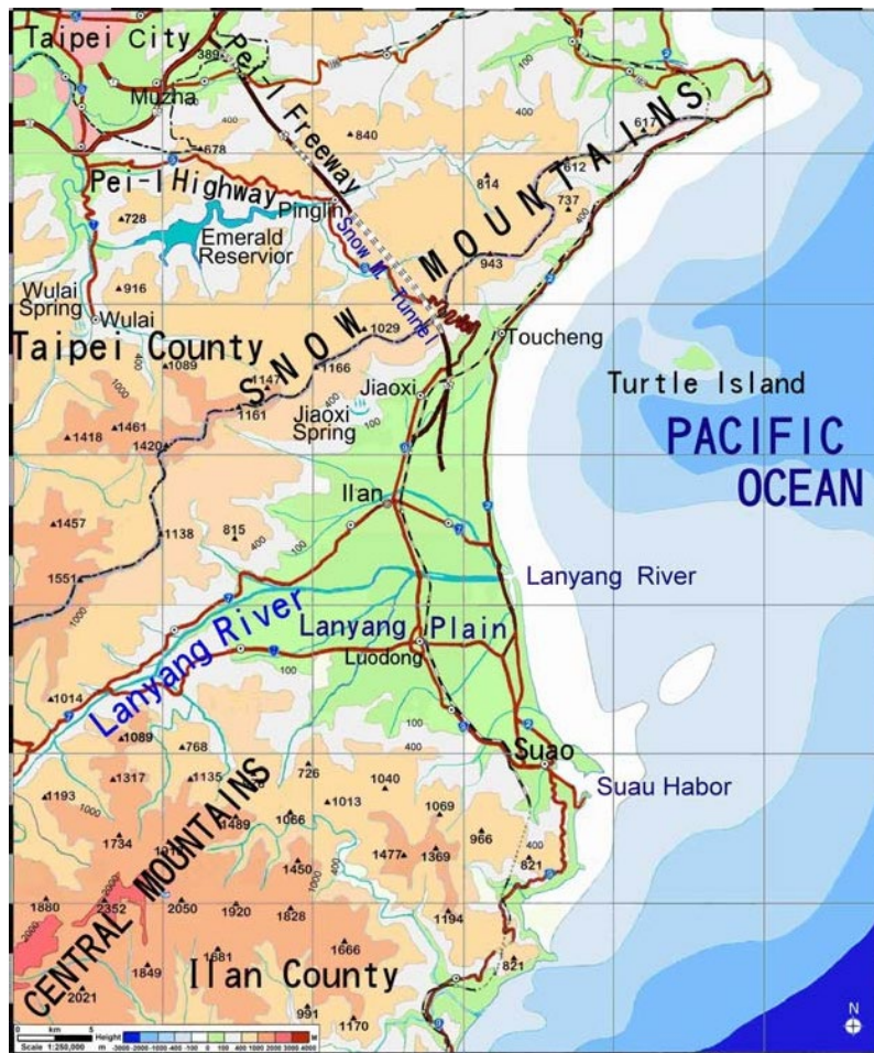
Figure 4. The map of northeastern Taiwan shows that there is an indentation of beautiful arched coastline, and the Suao Harbor should be once the Lanyang River mouth.