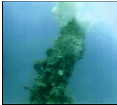
Figure 2. Near Turtle Island a nozzle of hot spring (4-m diameter and 10-m length) is the biggest in the world.

There are several hot springs that still remain today, the two most famous are: Jiaoxi Spring on the east side of Snow Mountain, and Wulai Spring on the west side. This indicates the volcanoes of northern Snow Mountain have erupted many times in the past.