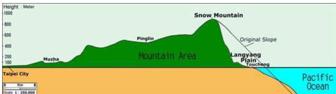
Figure 3. The profile from Taipei city to Toucheng around Pei-I Highway denotes maybe a landslide of Snow Mountain. The original eastern slope may be symmetric to the western slope.

When driving a car from Taipei City toward Ilan City through Pei-I Highway, we must climb the slope over 50 kilometers of straight distance across the western area of Snow Mountain to the ridge. When reaching the point of the ridge, we can see the whole landscape that presents Lanyang Plain just beneath our feet. Here we find a sudden drop of about 600 meters. In order to reach Lanyang Plain, we must negotiate 9 sharp bends and 18 changes of direction. The terrain features are not as symmetric as the western area of the mountain, so we may imagine that the eastern flank of the mountain has been cut out by a natural event a long time ago (Fig. 3). What is the natural event? We must understand the characteristics of northern Snow Mountain.